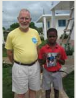
A reunion with his "grandson"